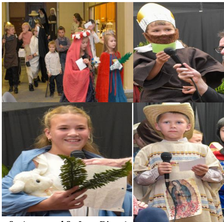
St. Agnes and St. Juan Diego!